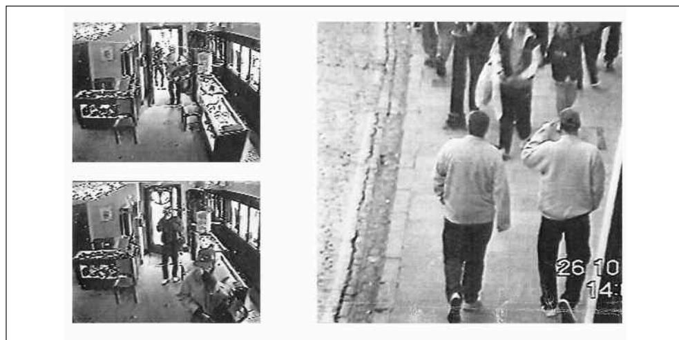
Figure 1 Example of CCTV footage from Operation Richterman

DS Wilf Pickles contacted me at my practice. He had been given my contact details by an image analyst with whom I had spoken at an expert witness conference a few weeks previously. DS Pickles informed me that he had CCTV footage of someone who appeared to have an unusual walk. The individual had, in lay terms, bow-legs of a large magnitude. Even though the individual wore two pairs of trousers, mask and gloves he could not disguise the way he walked. I was asked to provide a report outlining how likely it was that the person featured in the different police tapes had the same gait. Figure 1 shows an example of the footage I worked with.